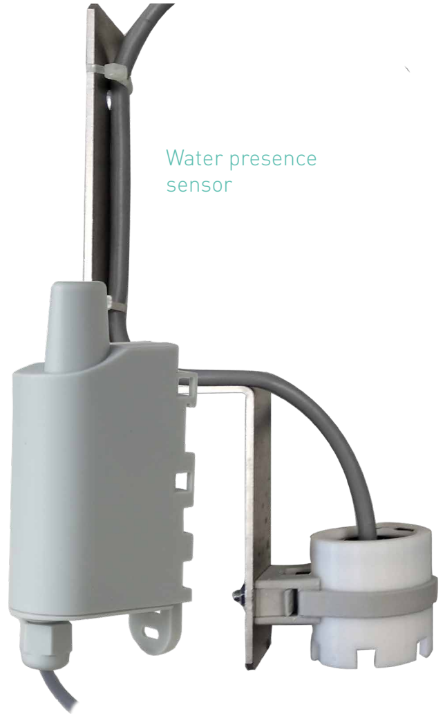
Water presence sensor